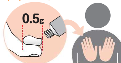
The quantity covers approximately the area of the two spread palms of an adult.

If the tube is squeezed on to the tip of an adult's index finger so as to reach to the first joint, the weight of the ointment is approximately 0.5 g, and this amount is sufficient to cover an area of skin approximately equal to the size of two adult palms. The amount of ointment used is decided on this basis, comparing the sizes of palms and the affected area.